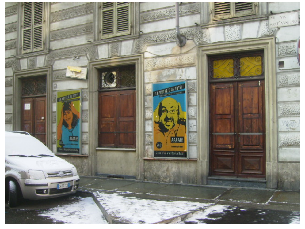
Image 3: attempts of an owner of a night-time venue to rise customers' awareness