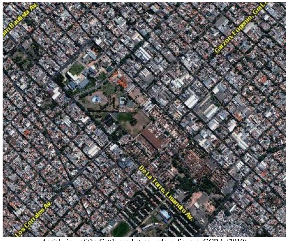
Aerial view of the Cattle market nowadays.

The major actors interested in the Markets permanence in its location were the cattle consignees, who developed their activities in there, and since 1992, are the concessionaires of the Market. This entails other benefits for them, as sub-renting parts of the Market. It is a powerful actor, linked to the meat industry, composed of the most traditional and richest families in the country. The consignees have historically had and continue to have great ability to lobby and to impose their demands and decisions to different governments. In coordination with the consignees, there are other actors involved in the functioning of the market as truckers who move the cattle and Market employees that favor the permanence of the Market, not to see their interests affected.