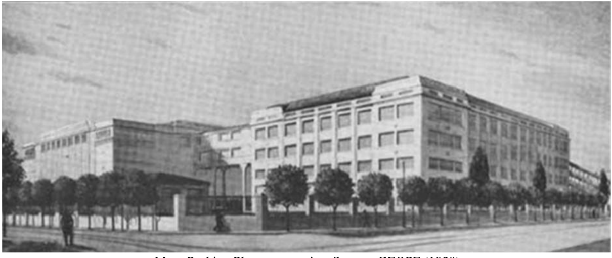
Meat-Packing Plant perspective.

The Meat-Packing Plant and the Cattle Market responded to the economic needs of a period in which the agricultural and farming industry had absolute centrality, where major infrastructure was required to perform the work of slaughter and trade cattle and a period in which the state tried to regulate these activities directly and indirectly.