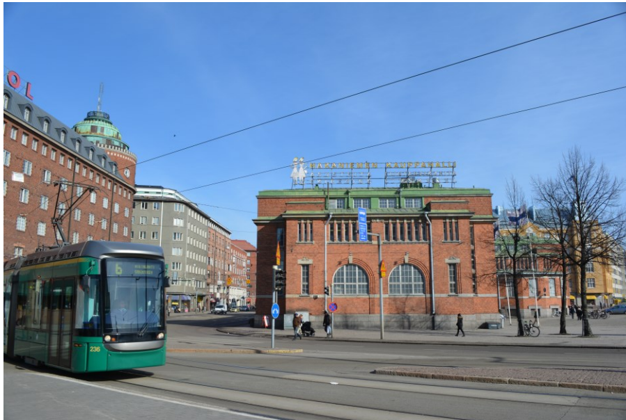
Figure 4. Hakaniemi Market Hall, the busy working-class neighborhood of Kallio

Market Hall has historically been in a wealthy neighborhood, and is located at a busy tourism hub of the city, the renovation never experienced widely-publicized resistance, and is openly celebrated as a success by vendors and city officials alike. Meanwhile, the market hall at Hakaniemi square is part of a different history, and the remodel has encountered significant resistance from vendors and Helsinki residents.