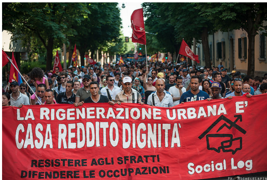
Figure 5. Demonstration of the organisation Social Log (6.6.2015)