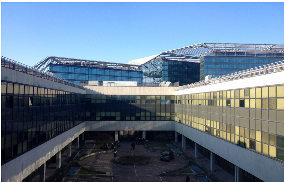
Figure 4. Inner courtyard of former Telecom, one of the two occupations performed in Bolognina by the political organization Social Log in 2014.

In the city of Bologna, the number of housing occupations has grown over the past few years, especially in the areas where the growing social fragility is more evident. During 2014, Bolognina saw a particular ferment in terms of housing occupations. In particular, the political organization Social Log occupied two considerably large unused private properties in order to meet the housing need of the weaker part of the population (Figure 4).