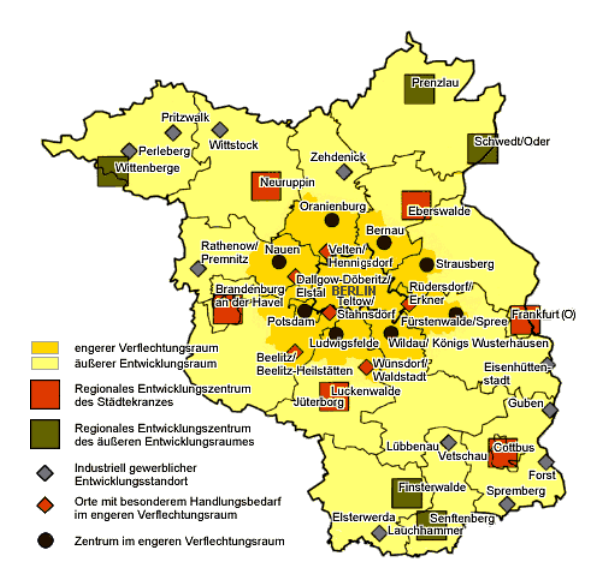
Figure 1: The model of 'decentralized concentration' in Brandenburg regional policy until 2005 Source: www.stadtentwicklung.berlin.de

The policy provided an organizational infrastructure based on a central steering office (the Steuerungsgruppe Regionale Wachstumskerne ) in the Gemeinsame Landesplanungsabteilung and on decentralized regional offices ( Koordinationsstelle Regionaler Wachstumskern ) in charge of coordinating interactions and activities involved in preparing integrated strategic development schemes at the micro-regional level.